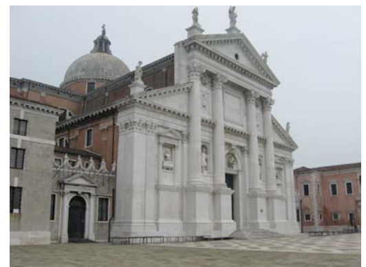
San Giorgio Maggiore, Venezia