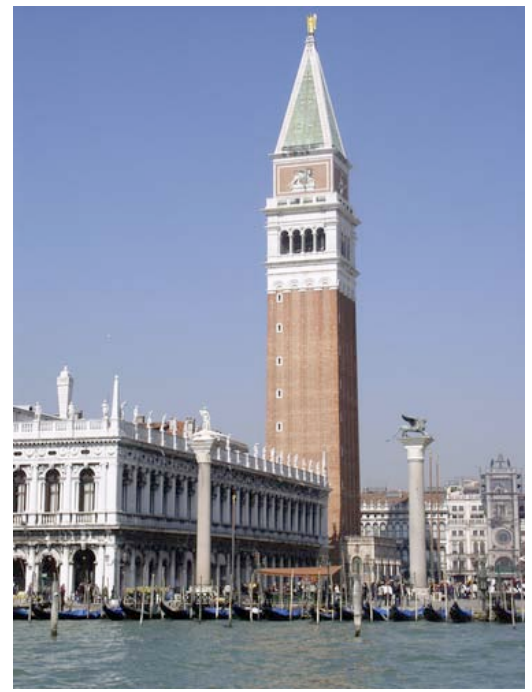
Campanile San Marco, Venezia

In winter time, the city of Venice and its region of influence, the Veneto, are most beautiful and evocative as the mist from the Adriatic Sea moves across the “lagoon” and the marshes of this extraordinary geography. The architecture of Andrea Palladio, in the city and the territory, is impacted by this muted northern winter light and the luminous clarity of the Italian Renaissance. This program consists of a visit to the city of Venice and to the work of Andrea Palladio. The artistic and cultural heritage of Venice and its territory, evident along its canals and squares, in museums and churches, expose a dazzling culture, which spans a thousand years. In Palladio’s architecture this extraordinary legacy is manifest in the theory behind the works and the buildings themselves. The houses, palaces and churches Palladio built in the 16 th century are works of lasting values and exceptional lessons in architecture and urbanism. The program visits specific works of Palladio in Venice, Vicenza and the countryside as well as works by artists and architects within the cultural sphere which affected Palladio’s work, such as the painting schools of Venice and the frescoes of Giotto in the Scrovegni Chapel in Padova; and in Mantova, the influential work of Leon Battista Alberti, Andrea Mantegna and Giulio Romano.