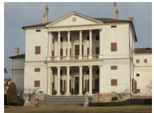
Villa Cornaro-Rush, Piombino Dese