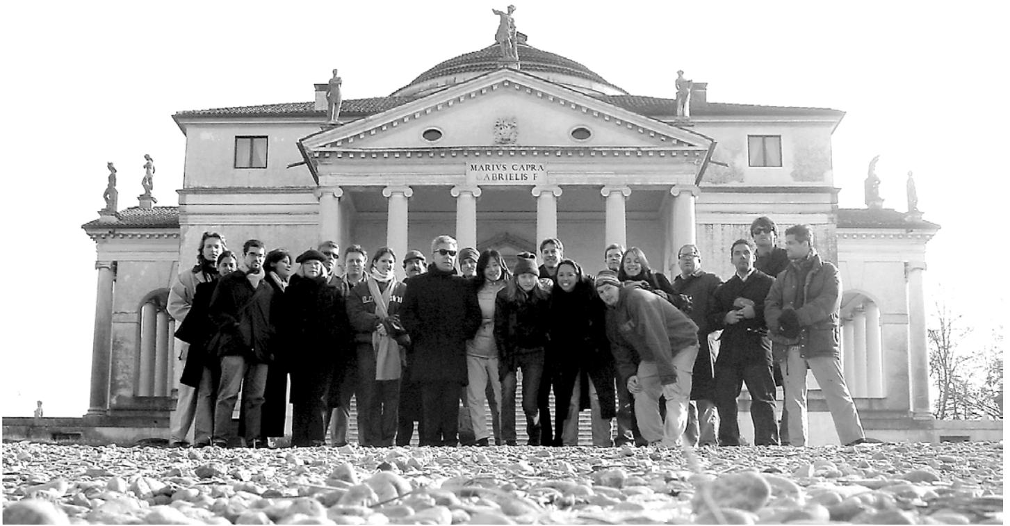
University of Miami Palladio Journey, 2001