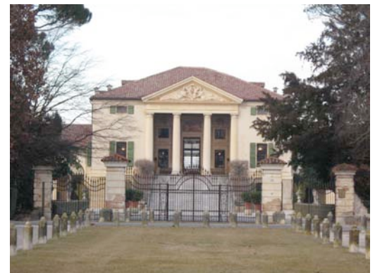
Villa Emo, Fanzolo di Veduggio